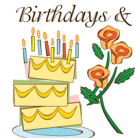
Birthdays & Anniversaries